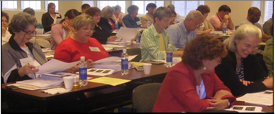
Workshop participants eagerly review training materials.

Approximately 260 mediators across the state participated in four day-long child support training workshops offered by the Dispute Resolution Services Office as part of the mediator quality assurance initiative begun in 2005. This undertaking was described in the December 2005 issue of Resolutions . The successful workshops were the result of the combined efforts and talents of mediators across the state and generous donations of meeting space by the George Mason University School of Law, Roanoke Higher Education Center, Regent University School of Law, and the University of Richmond School of Law. Grant funding provided by the Department of Social Services was instrumental in the development and success of these child support training workshops.