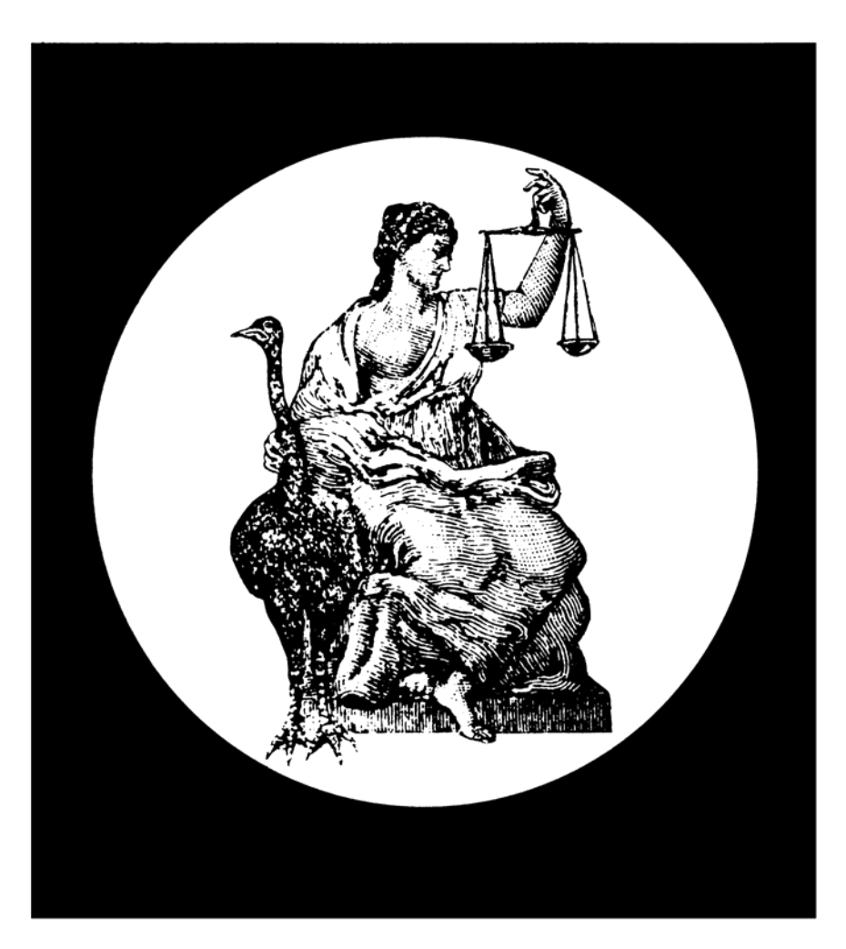
The Supreme Court of Virginia